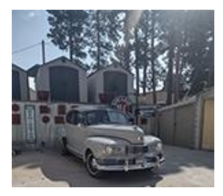
Wednesday Cruise to Primrose 8/16/23