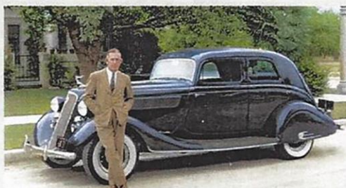
1935 Studebaker President Land Cruiser