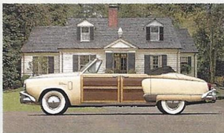
1951 Studebaker Conestoga Open Touring Sedan