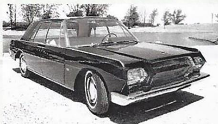
Brooks Stevens' 1965 Studebaker Lark Cruiser Prototype