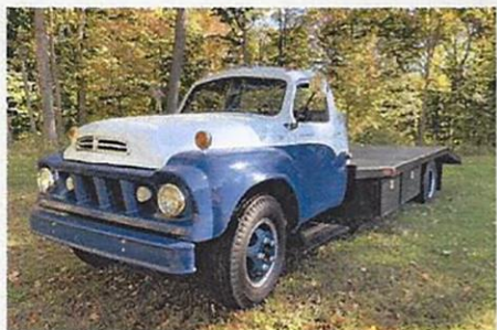
1957 Studebaker Transtar car hauler