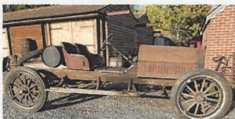
1916 6 cylinder Studebaker Speedster was found in a lumber shed in Minnesota