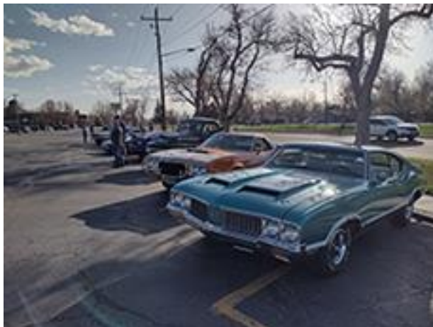
Wednesday night cruise, 5/3/23