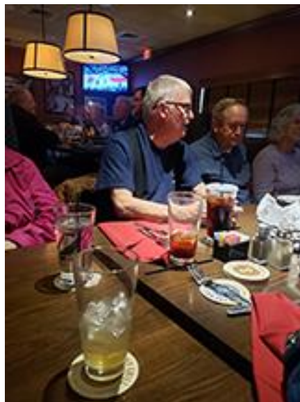
Friday night dinner at J's Pub