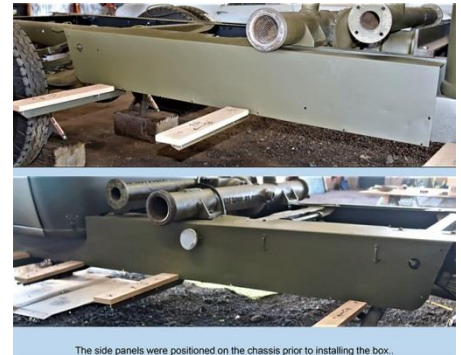
The side panels were positioned on the chassis prior to installing the box.