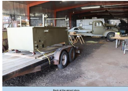
Back at the airport shop.