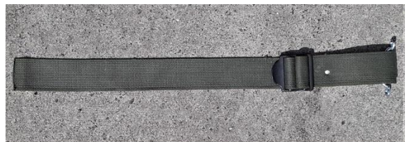
Kistler Tent and Awning mocked up a WWII-looking strap. An order for four ladder straps and two hose straps was placed.