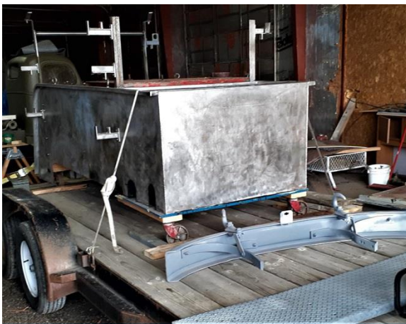
The box loaded onto the trailer and ready for moving to the paint and body shop.