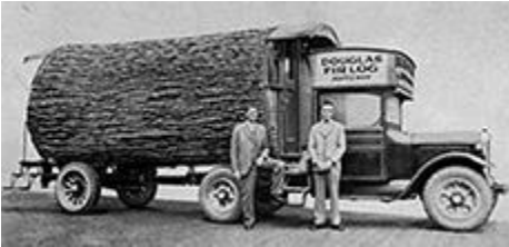
Log motor home by Wade, 1922.