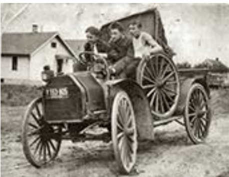
Three friends take a joyride in their 'new' vehicle, Ohio, c. 1924.