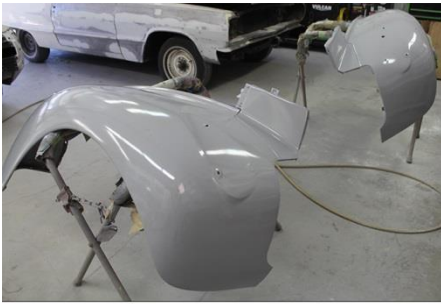
The fenders with fresh primer at Doug Walters' shop.