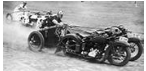
Motorcycle chariots, 1920's.