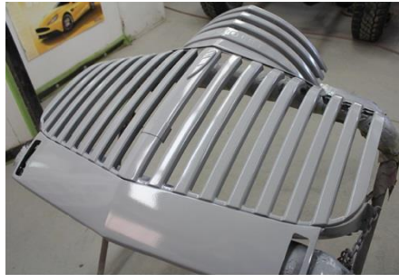
The grille with fresh primer.