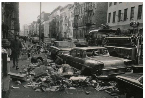
New York City sidewalks filled with trash during the 1968 strike of sanitation workers.