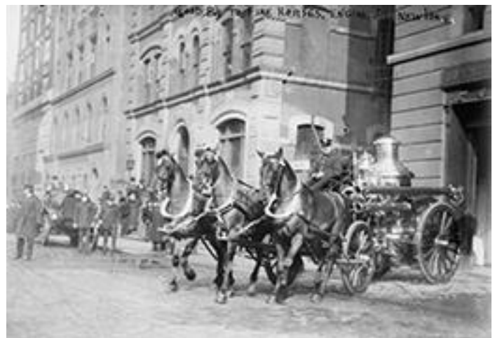
A horse-drawn fire engine of Engine No. 39 leaving Fire Headquarters for the last time after being replaced with a motorized fire engine, New York City, February 19, 1912.