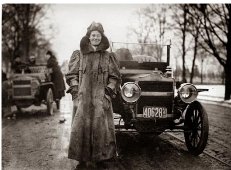
Alice Huyler Ramsey, the first woman to drive across the U.S. from coast to coast, 1909. Only 152 miles out of the total 3600 mile trip were on paved roads.