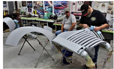
Fenders and grille after the primer was sanded.