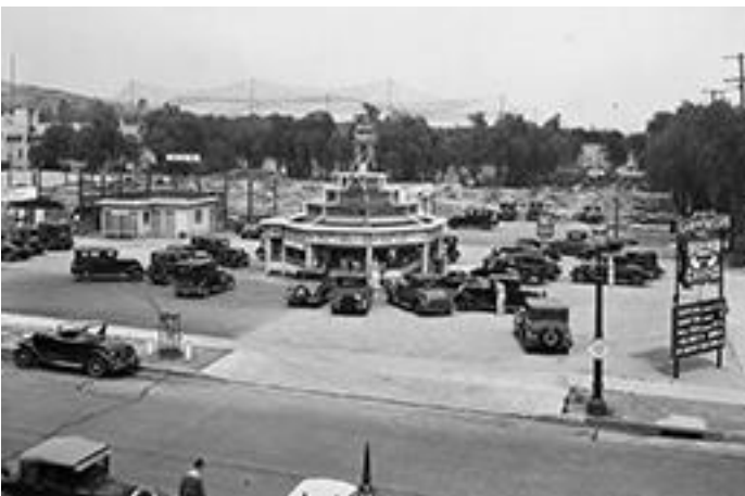
Drive-in restaurant on West Sunset Blvd., Los Angeles, 1932.