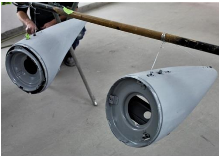
Headlight bodies in the paint booth ready for painting.