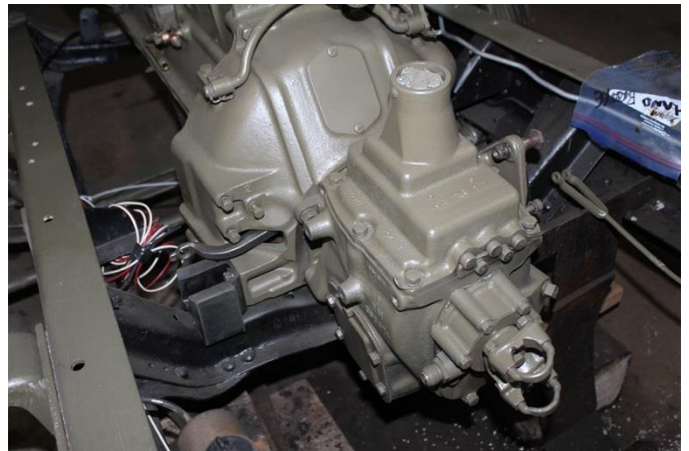
The recently installed transmission and its new OD paint job.