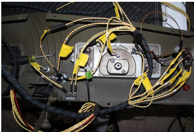
Wiring harness is mocked up in the dash.