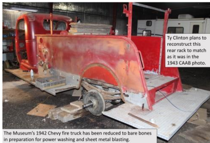
The Museum's 1942 Chevy fire truck has been reduced to bare bones in preparation for power washing and sheet metal blasting.