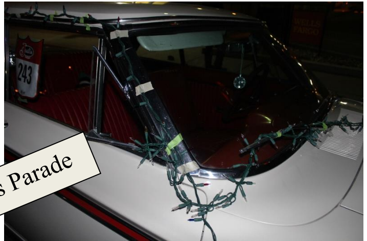
2014 Casper Christmas Parade