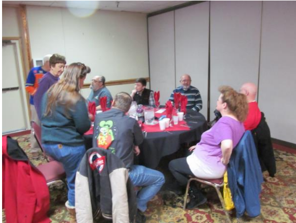
Nice turn out